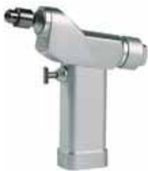
GEOORTHO8103 Wire and pin drill (Hand surgery)