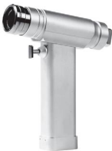
GEOORTHO2100 Handpiece (System Multi-function)