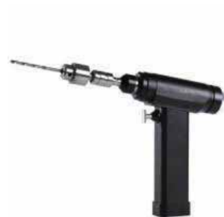
GEOORTHO1107B/D Acetabulum reamer (System general)