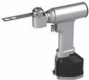
GEOORTHO4301 Oscillating saw