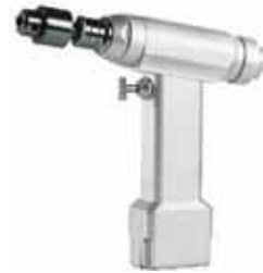
GEOORTHO4107 Acetabulum reamer