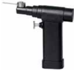
GEOORTHO8101 Oscillating saw (Hand surgery)