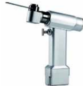
GEOORTHO4101 Oscillating saw