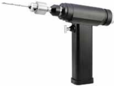
GEOORTHO1012. Normal drill (System general)