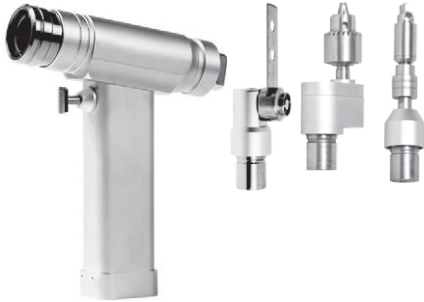
GEOORTHOGE2000 Multifunctional handpiece(with 3 heads) (System Multi-function)