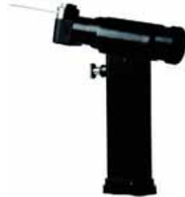
GEOORTHO1401 Oscillating saw (System general)