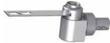
GEOORTHO4201 Oscillating saw (System Multi-function)