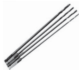
GEOORTHO4012.1SAO AO quick release drill bit 2, 2.5, 2.7, 3.2, 3.5, 4, 4.5