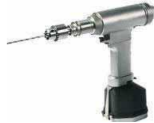
GEOORTHO432.A Dual function drill