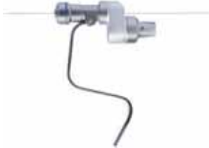
GEOORTHO8213 K-wire drill attachment(0.8MM-2.0MM)