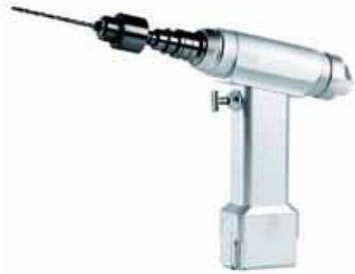
GEOORTHO4012.A Dual function drill