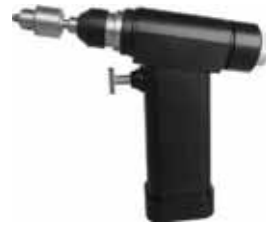
GEOORTHO8012. Normal drill (Hand surgery)