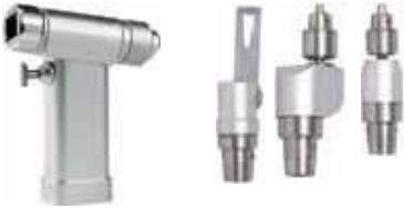
GEOORTHOSWGE Surgical power tools (Multi-function hand surgery) (with 3 heads)