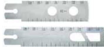
GEOORTHO92.21.0A, GEOORTHO90141.0A, GEOORTHO72.40.8B Blade