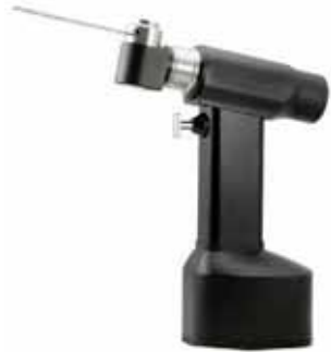
GEOORTHO6101 Oscillating saw (System 6000) (black)