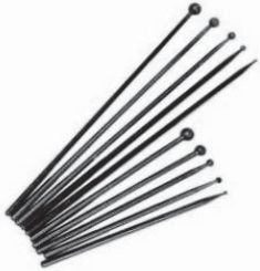
GEOORTHO32011 Cutting drill bit(length 70mm, 110mm, diameter 1-6mm)