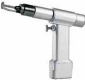
GEOORTHO4106 Sternum saw