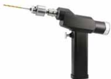
GEOORTHO1103B/D Dual function Wire and pin drill (System general)