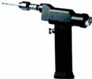
GEOORTHO1403B Dual function Wire and pin drill (System general)