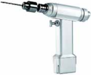
GEOORTHO4012. Normal drill