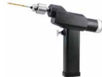
GEOORTHO1103 Canulate drill (System general)