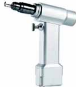
GEOORTHO4105 Cranial bur