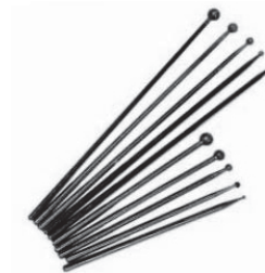
GEOORTHO32012 Diamond drill bit(length 70mm, 110mm, diameter 1-6mm)