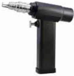
GEOORTHO1105 Cranial bur (System general) (NEW )