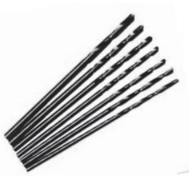
GEOORTHO1012.1 Normal drill bit 2, 2.5, 2.7, 3.2, 3.5, 4, 4.5