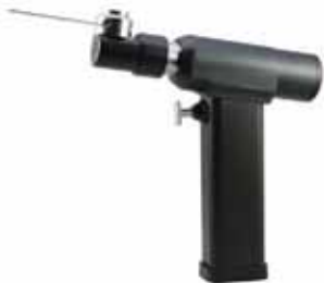
GEOORTHO1101 Oscillating saw (System general)