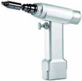
GEOORTHO4104 Cranial drill