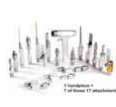
GEOORTHOGE2000 Multifunctional handpiece(with 7 heads) (System Multi-function)