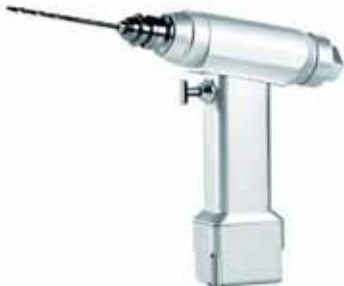
GEOORTHO4012.SAO Ao drill