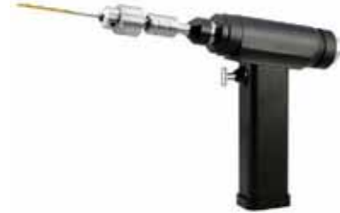
GEOORTHO1012.A Dual function drill (System general)