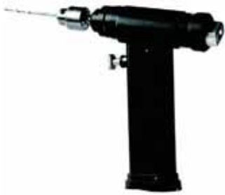
GEOORTHO142. Normal drill (System general)