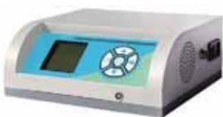
GEOORTHO3001 Power Console