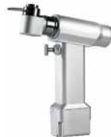
GEOORTHO4108 Overhual saw