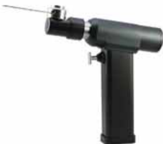
GEOORTHO1108 Overhual saw (System general)