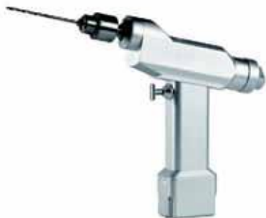
GEOORTHO4103 Canulate drill