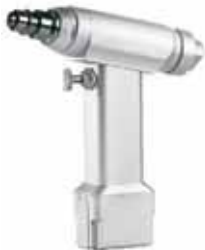
GEOORTHO4107B/D Acetabulum reamer