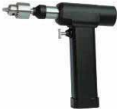
GEOORTHO1107 Acetabulum reamer (System general)