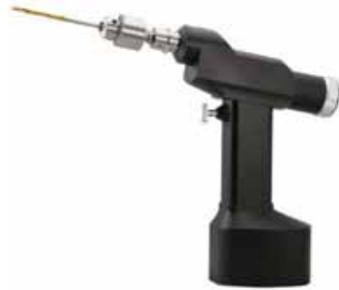
GEOORTHO6103B canulate drill (System 6000) (black)