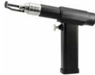
GEOORTHO1106 Sternum saw (System general) (NEW )