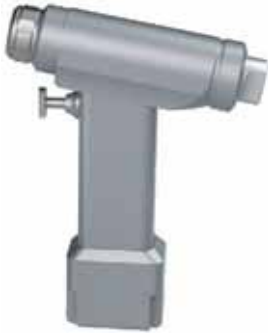
GEOORTHO4200 Handpiece (System Multi-function)